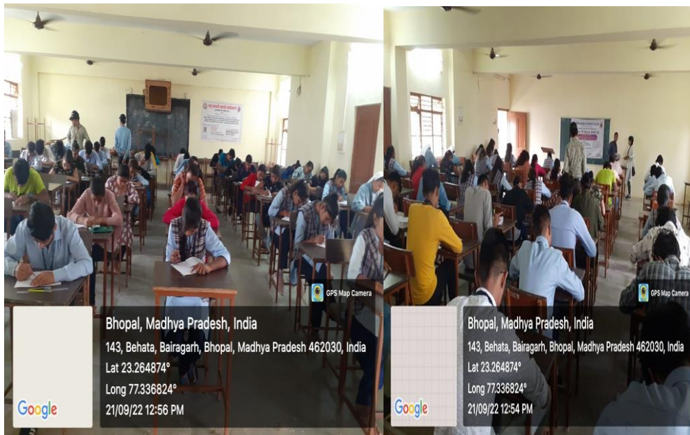
Students appeared in Super 30 written Exam on 21 st September 2022