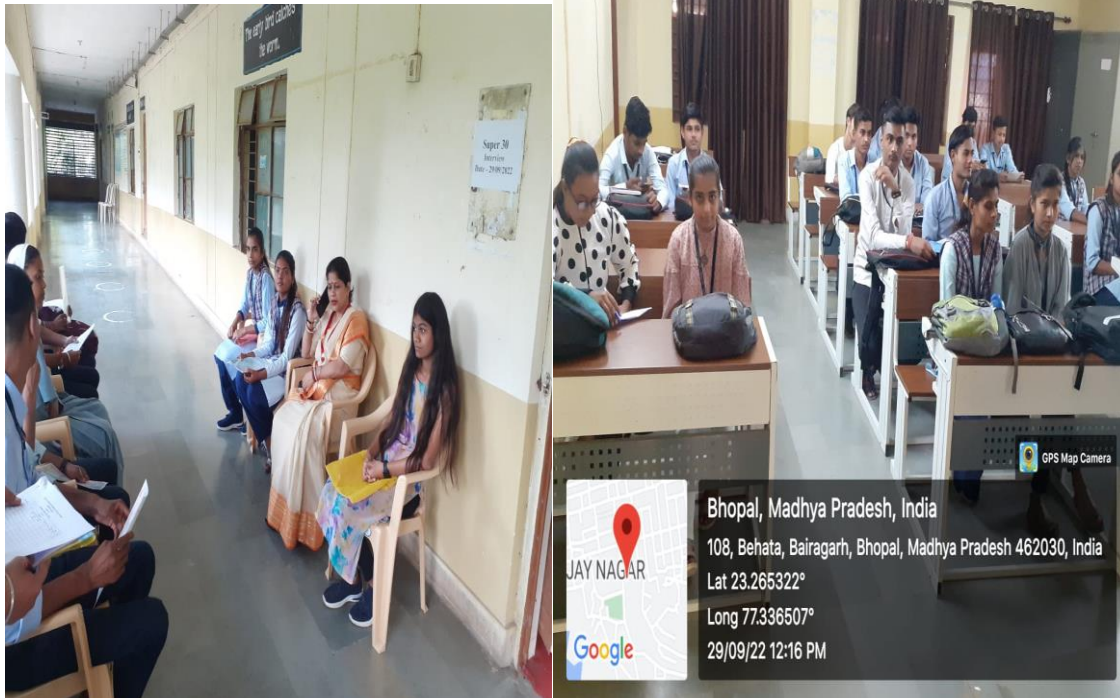
Students waiting for super 30 Interview